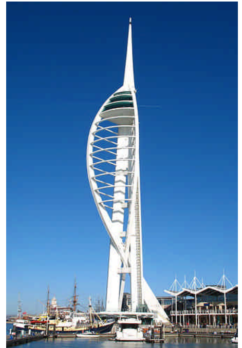
Portsmouth – City of progress

Offering independent advice on Highway Assessment Surveys and Systems